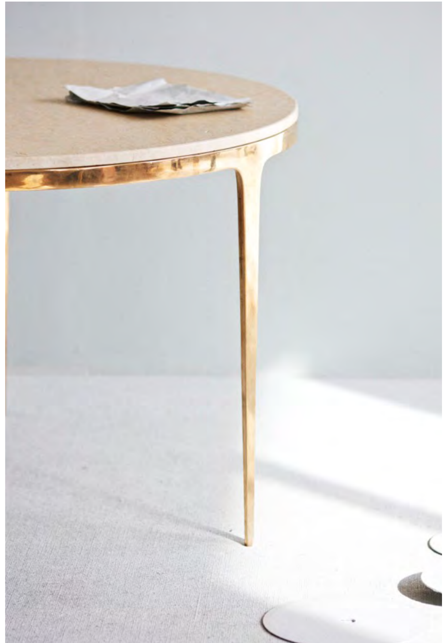
BRONZE round table 1200 with Perlato Olimpo marble